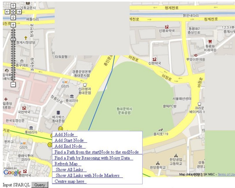
Fig. 3. Screenshot of the RSM Interface